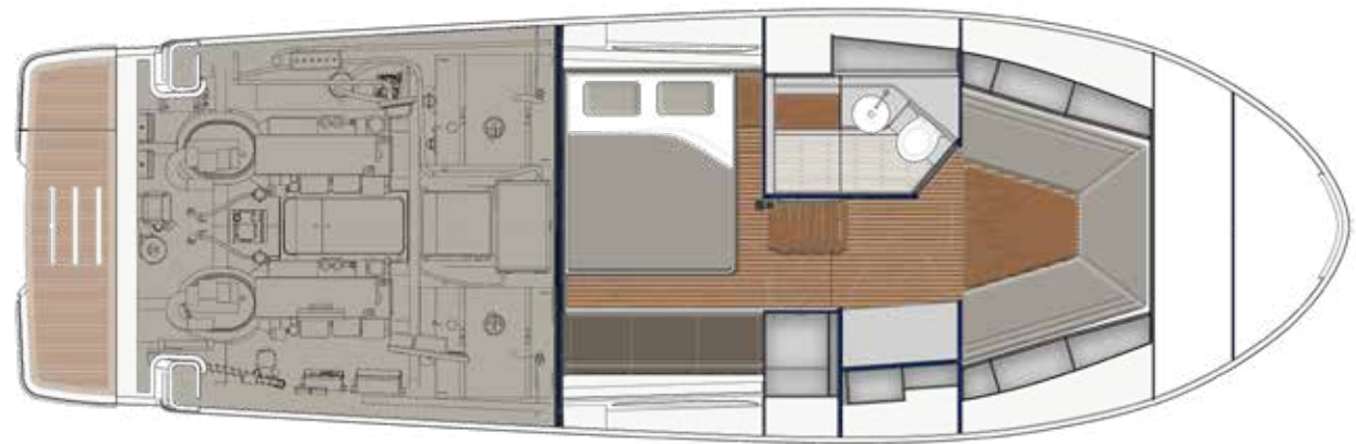
LOWER DECK B