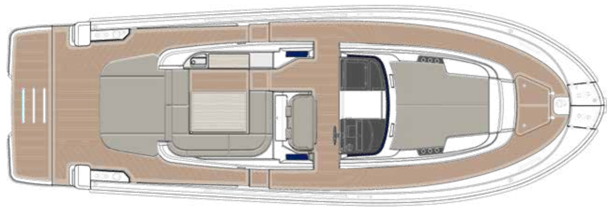
LOWER DECK A